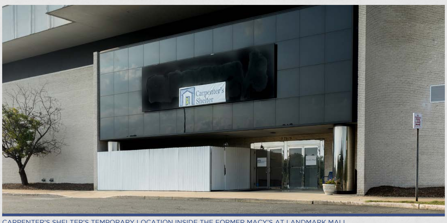
CARPENTER'S SHELTER'S TEMPORARY LOCATION INSIDE THE FORMER MACY'S AT LANDMARK MALL

Learn about the values that embody the mission and vision of Carpenter's Shelter, and what they mean for you.